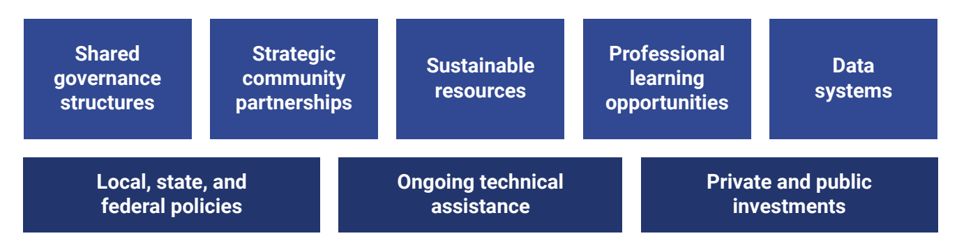
Figure 5. Supportive Infrastructure