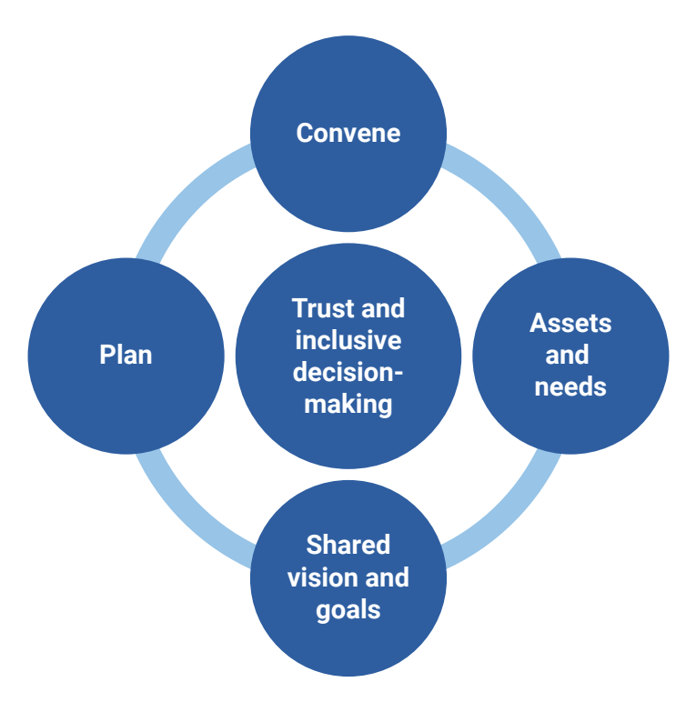
Figure 2. Take Stock and Plan