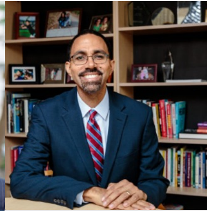
John B. King Jr.