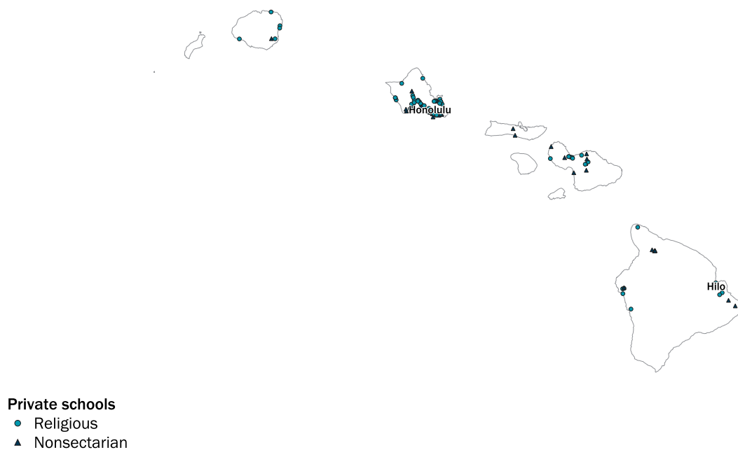
Figure 2. Private Schools in Hawaii, 2021–22