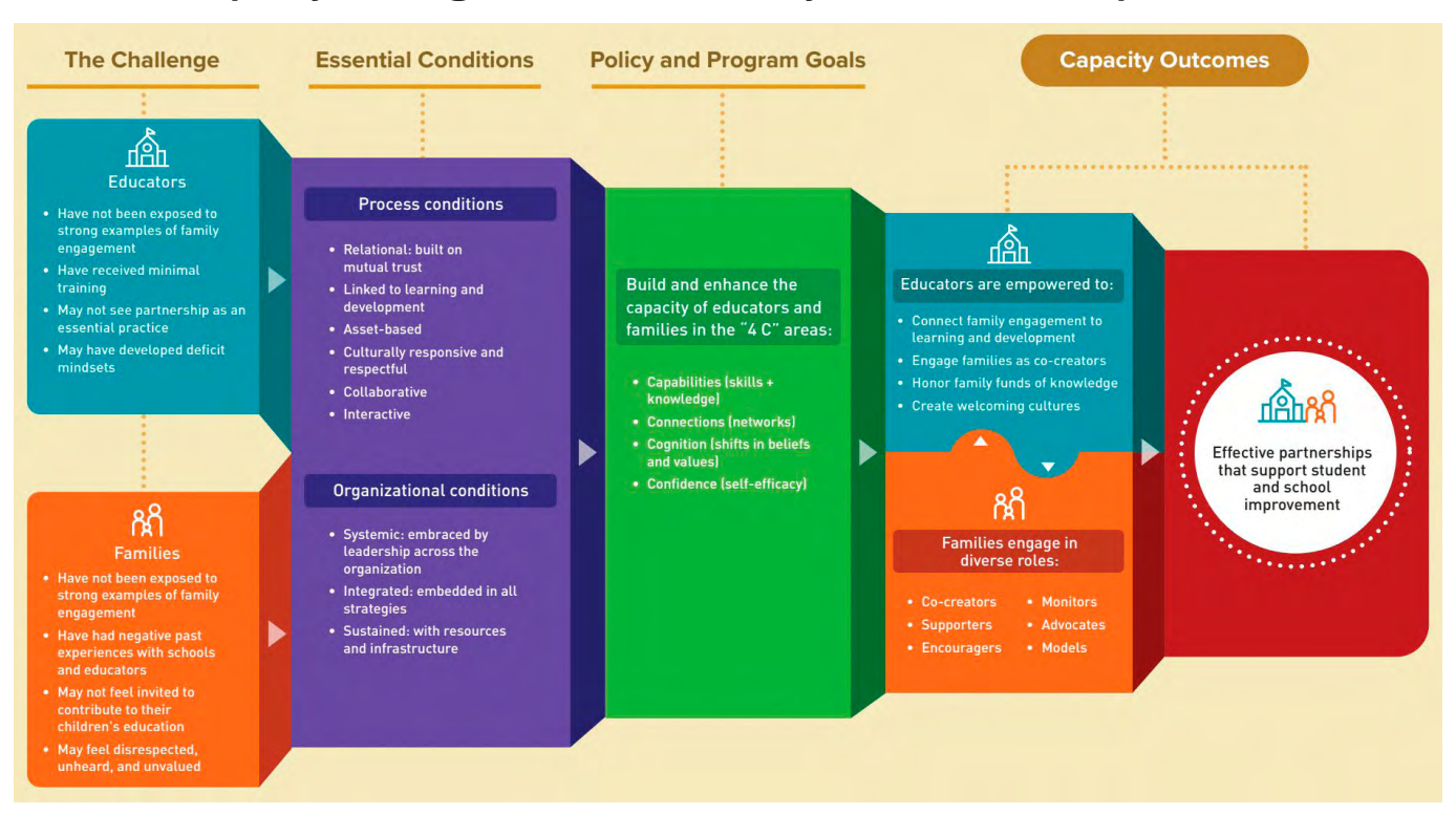
Figure 2 The Dual Capacity-Building Framework for Family-School Partnerships